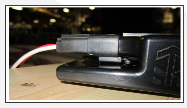
FIGURE 2. CONNECTION