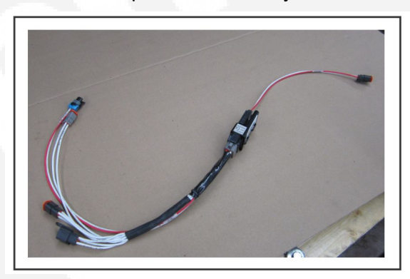
FIGURE 1. HARNESSES